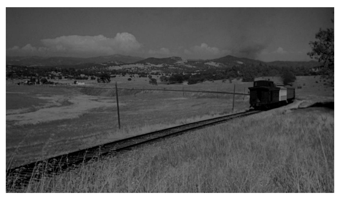
Ill. 4. The train and the railroad: symbols of a new era.

Here we have the film's predicament: Stoddard is not ready yet to take the stage, even as Doniphon is not ready to make way for the new mode of being in America. This ultimately means that he is not ready to sacrifice his life by living in memory. In Ford's cinema, and in the politics of myth, bodily death is by no means obliteration, which is in line with the philosophical principle of the timelessness of human nature.<sup>27</sup> To Ford, to live has to do with conservation, recollection, and observation.